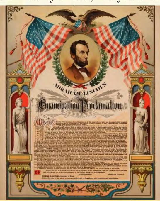
A bloody year instructs a greater purpose.

Irish Brigade Camp No.4 accomplished another event filled and memorable year in honor of the service and sacrifices made by our ancestors. In an apprehensive year of national political and social debate, 2017 provided a turbulent backdrop where matters lingering from the long ago war came to public attention once again! For us Brothers, it was an occasion to remind the public of the horrific reality of war that gripped the nation 155 years earlier and the resulting proclamation that sought to advance the concepts of human freedom and liberty enshrined in the Declaration of Independence. And so 2017 marked yet another