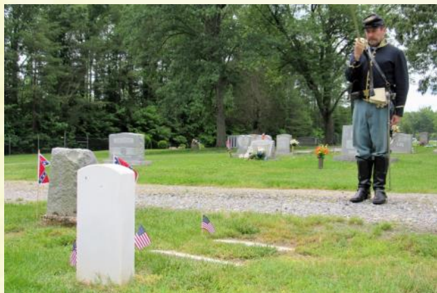
CC Standard renders honors at soldiers marker.

not burials but cenotaphs, memorials for persons buried elsewhere.