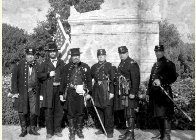
Brothers Withrow as General Grant and Standard as General Sheridan with AoP Staff members in front of the Civil War Tomb of the Unknown .

Army of the Potomac Eastern Theatre Headquarters Staff in the humbling honor of placing 20 wreaths at the 150th Anniversary Ceremony of the dedication of the Civil War Tomb of the Unknown at Arlington National Cemetery.