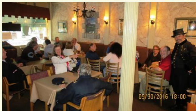
Brothers and spouses at the Blarney Stone.

iantly stood before all the restaurant's patrons and read General Logan's Grand Army of the Republic General