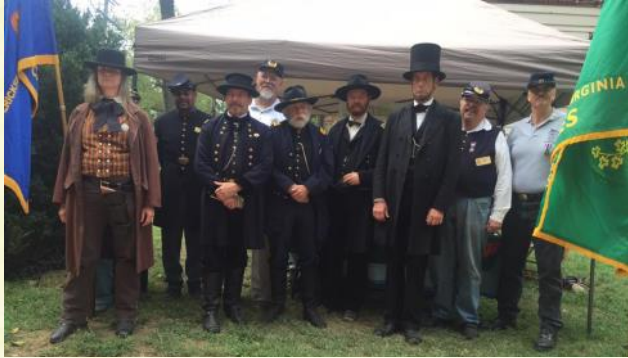
YIF 2016 group photo in front of Camp display table.

American Civil War. The event was held on the grounds of the historic Moncure-Conway House. Brother's Standard and Withrow reprised their impressionist portrayals as Generals Grant and Sheridan. Brothers passed out informa-