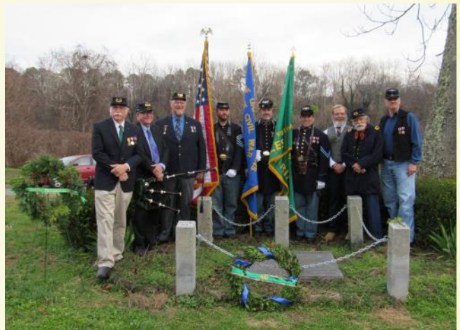
Group photo after the wreath laying ceremony.

Brothers came together once again for the annual commemoration and wreath laying at the Irish Brigade Monument near the Fredericksburg City Dock.