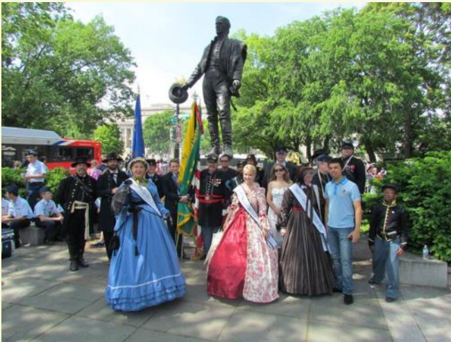
An after parade photo op before going to the Willard.

dan. Following the parade, Brothers passing the White House on their way to the historic Willard Hotel were be-