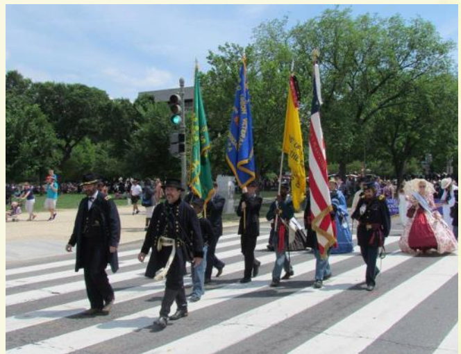
Generals lead the SUVCW Color Guard in the parade.