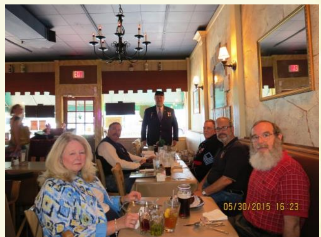
Brothers and spouses at the Blarney Stone.