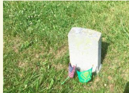
A Grave marker with Irish Brigade tributes placed next to it.