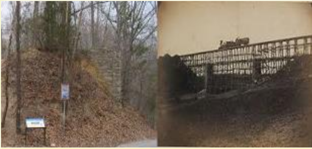
Historic marker at the site of the Potomac Creek Bridge [Lt] and original picture of the bridge [Rt].

located on White Oak Road. We also submitted one history marker for the Potomac Creek Bridge in Daffan, Stafford County, VA.