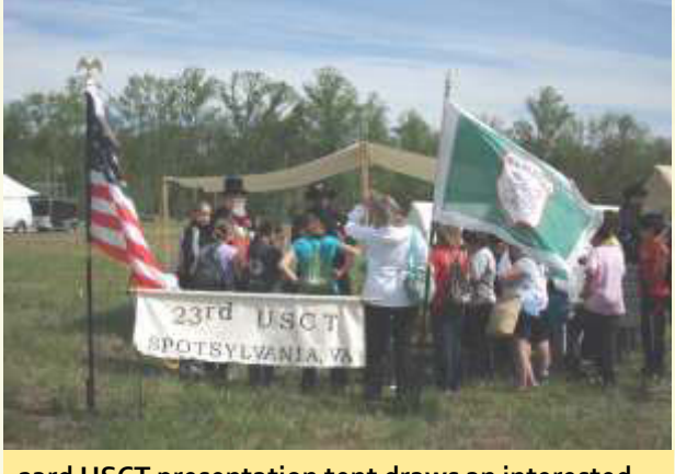
23rd USCT presentation tent draws an interested

Dedication of marker for the 23rd United States Colored Troops (USCT) - 17 May. The Irish Brigade Camp No. 4 came out in force to support the NPS commemora-