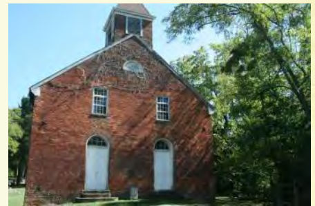
Historic Union Church in Falmouth.