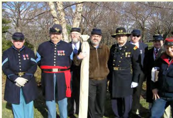
SUVCW Brothers gather at Arlington National Cemetery for the internment of USS Monitor Sailors.