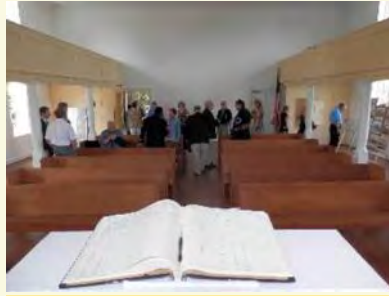
Tour of inside of Salem Church.

Camp along with nine members of the Taylor-Wilson Camp and Depart-