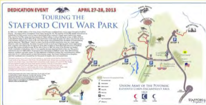
Poster for the grand opening of the new Civil War Park.

Stafford Civil War Park (SCWP) Grand Opening - 27 April. The Stafford County Department of Economic Development and Tourism and the Friends of Stafford Civil War Sites (FSCWS) hosted the grand opening of the new