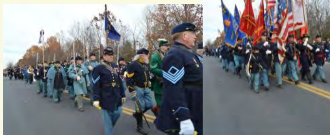
SUCVW was well represented at the Gettysburg parade.