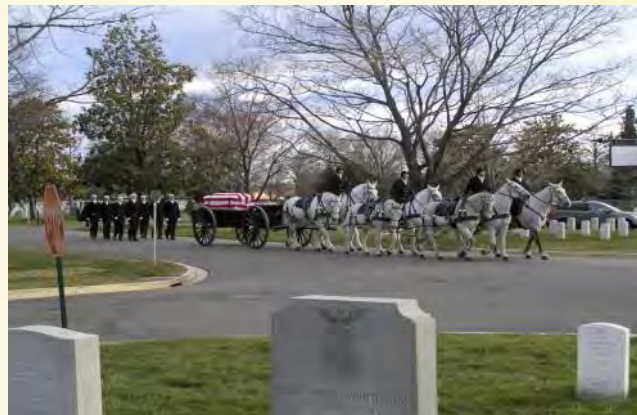
Horse-drawn caissons take the two USS Monitor sailors to their final resting place.