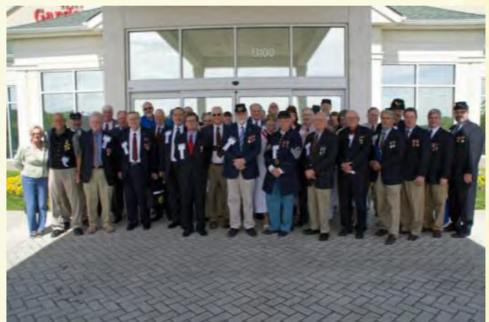
126 th Department Encampment group photo at hotel.

Discussed at the Encampment were protection of Civil War monuments, insurance coverage for Department and Camp events and activities, our SUCVW status under the IRS, and the possibility of holding the 2015 National Encampment in Richmond, VA. The luncheon speaker spoke about the War in Southern Maryland. At the encampment's Memorial Service all sang that great old hymn, Amazing Grace.