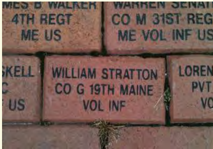
Commemorative brick at NCWM.