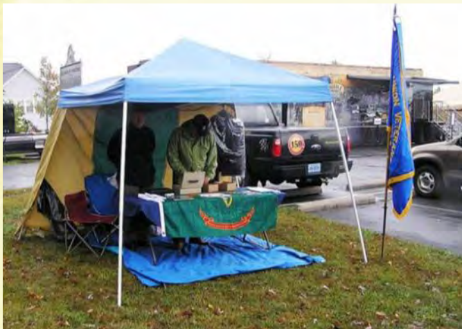
Brothers endure rainy weather at Bristoe Station event. Brothers of Union Veterans of the Civil War were handed out.