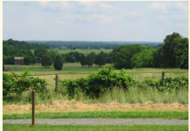
Bristoe Station Battlefield view from Trail Stop #7.

Battle of Bristoe Station Staff Ride - 27 July. Brother Jay Rarick conducted a staff ride about the Battle of Bristoe Station. Three Camp Brothers and one potential Brother participated.