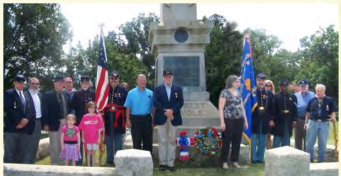
Wreath-laying at the 23rd NJ Infantry Monument.

Visit to the Salem Church Battlefield, Fredericksburg Virginia - 3 August. Brothers attended a Wreath-laying event at the 23rd New Jersey Infantry Monument at Salem Church Battlefield. In attendance were ten Brothers of our