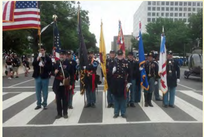
SUVCW Color Guard at National Memorial Day Parade.

National Memorial Day Parade, Washington D.C. - 27 May, Afternoon. Camp Brothers participated in the SUVCW color guard for the National Memorial Day Parade. Following the parade, Brothers passing the White House on their way to the historic Willard Hotel were besieged